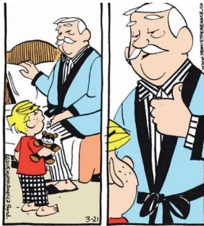
"DO YOU COUNT SHEEP TO GET TO SLEEP, GRAMPA?" "NOPE... I TALK TO THE SHEPHERD."